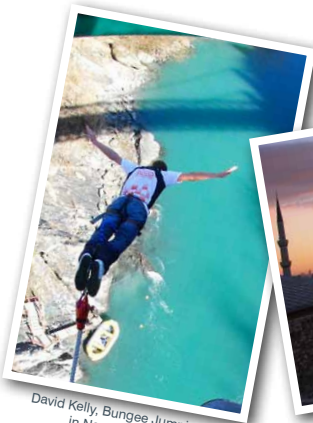
David Kelly, Bungee Jumping in New Zealand

Following the success of Mode 4 Mode over the last three years the competition just gets better! Below are just a sample of the 2011 creative photo entries featuring the MODE DESIGN logo. These plus many more will be judged by our expert panel later this month.