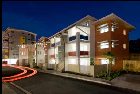
Client: Brisbane Housing Company Location: Oxenham Apartments, Nundah, QLD

St George Community Housing (SGCH) is a community based not for profit housing provider delivering many affordable housing projects in conjunction with Councils across Sydney.