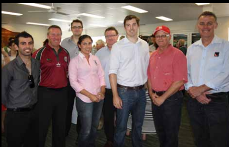
Mode Design & Leightons Construction team