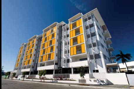
Client: Brisbane Housing Company Location: Masters Street Apartments, Newstead, QLD