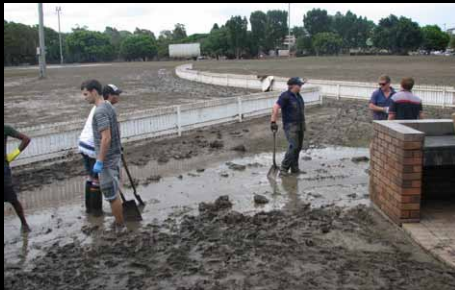
January 2011 floods - South Brisbane District Cricket Club