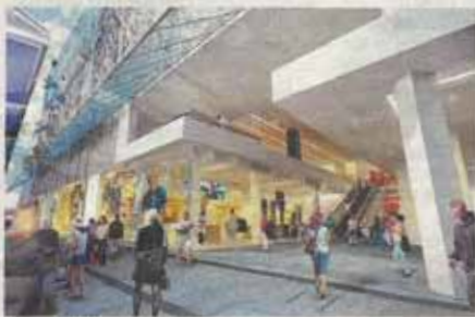
An artist's impression of the Wintergarden project

Brisbane 78 Annerley Road, Woolloongabba, QLD 4102 PO Box 8115, Woolloongabba, QLD, 4102 Tel: +61 7 3891 6828 Fax: +61 7 3891 6373 E-mail: brisbane@modedesign.com.au