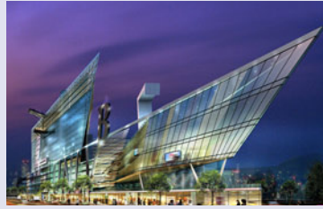
Images above are taken of MODE DESIGN's master planned concept for the University of Las Vegas designed in 2008.

In 2011 we continue to provide quality services in the following areas to our valued Clients: