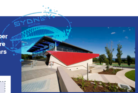
The Marie Bashir Mosman Sports Centre completed by MODE DESIGN in December 2010.

Off the back of the highly successful Marie Bashir Mosman Sports Centre completed in December last year, our Sydney team has won the bid for the Storey Park Child Care and Community Centre for Hornsby Council. The new centre will accommodate 72 children between the ages of 0-2 years old and includes an additional flexible community centre to host local meetings and functions. Congratulations team!