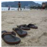
Gold Coast, Hong Kong